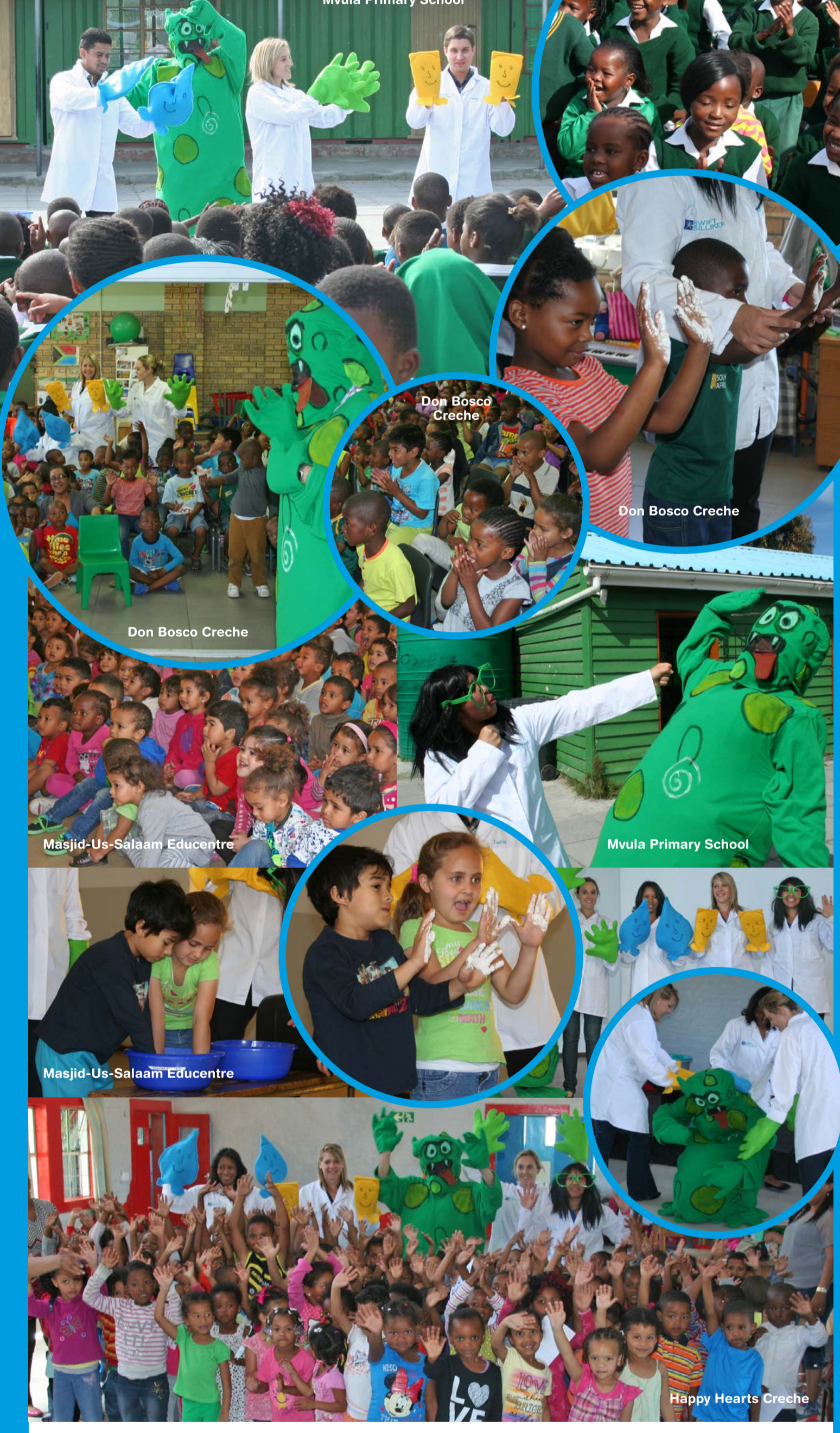
Mvula Primary School

The Cape Town events were held in collaboration with the City of Cape Town, who allocated the areas.